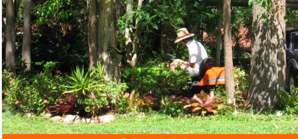
Reclaiming the Yard